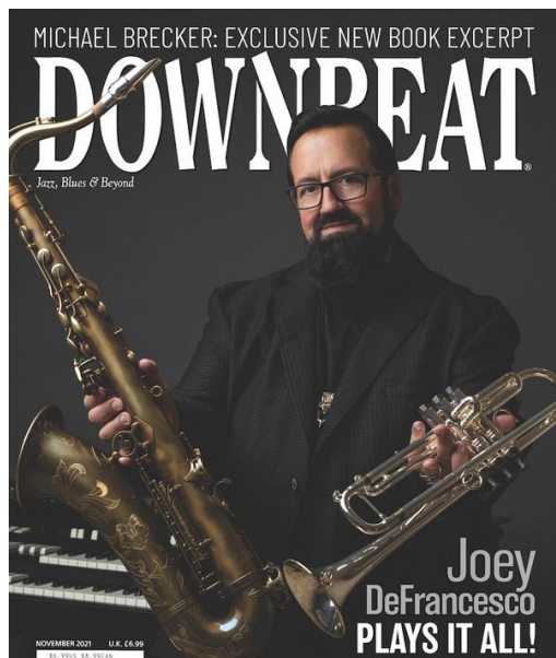
Jazz Legend Joey DeFrancesco held a Masterclass at Fort Hayes previous to his Masterclass at OSU.